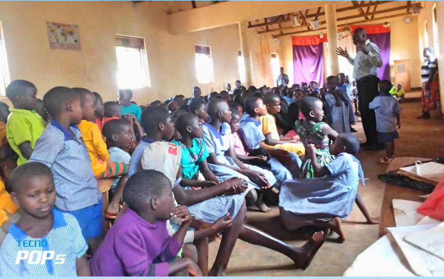
Children's CHE in Uganda Schools