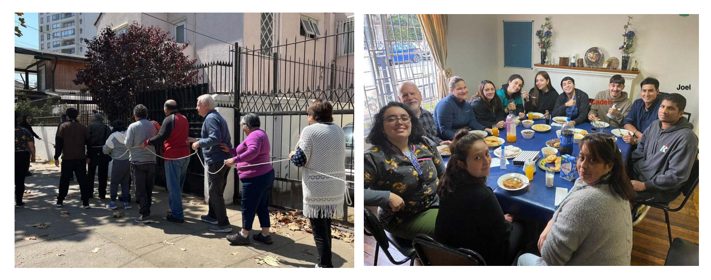
Earthquake drill at CEMIPRE

We have been offered a matching fund challenge which would allow us to employ an executive director whose main focus would be to discover financial support locally so CEMIPRE can become self-sustaining. We are currently at 32% of the funds needed to meet that goal. Please consider giving a one-time gift to help us get those funds before the November deadline. Thank you all!